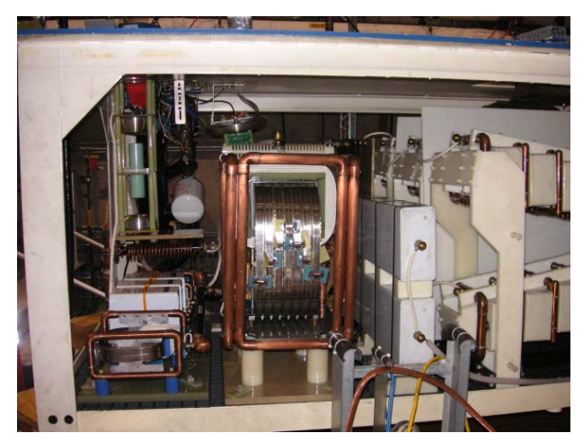
Figure 2: View of doubler capacitors and output filter choke

To avoid saturation of the output filter choke, the modification was simple. By removing the appropriate number of turns this ensures the volt-second ratings of the choke were not exceeded. The other modification of the output filter network was to reduce the output series resistance to \sim 2 Ohm. These resistors absorb the system stored energy when the klystron arcs-down. The output filter changes do not sacrifice the klystron fault energy and the reduced values provide a faster rise-time with overshoot. The resonant rectification minimal assemblies, doubler capacitors, and output filter choke can be noted in Figure 2, from right to left. Other assemblies can be seen, the small assembly with the corona rings is a harmonic trap network that minimizes bleed-through of higher order switching harmonics.