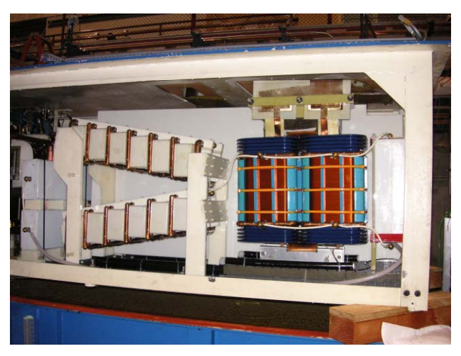
Figure 1: View of resonating capacitor, nanocrystalline boost transformer, and resonant rectification assembly

To implement these changes LANL modelled the ILC performance requirements utilizing the convertermodulator data from the SNS operations. However, to facilitate production of the new nanocrystalline boost transformers for SLAC, the only core material easily available was the VacuumSchmelze Vitroperm 500. This core material was surplus from the Los Alamos prototyping efforts and is different than the SNS production run that used Hitachi "FT-3". The Vitroperm 500 has a lower "mu" (25,000 vs 50,000) and a lower stacking factor, ~75% vs ~90% for the FT-3.