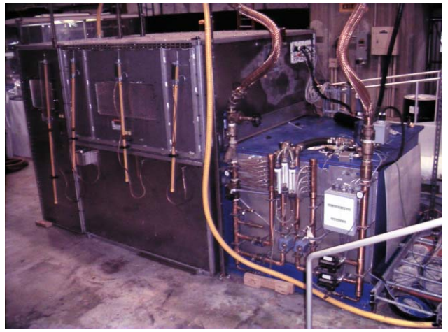
Figure 4: 15 MW output converter-modulator

The converter-modulator, as shown in Figure 4, was installed on schedule at SLAC. The installation is different from those at LANL and ORNL. Access to the modulator tank internals at SLAC must be accomplished in-situ. LANL and ORNL air-pad the modulator from beneath the safety enclosure for access to the internals. SLAC must lift the safety enclosure and because of earth quake concerns, the modulator is bolted to the floor.