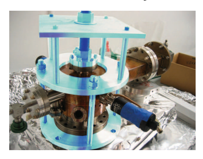
Figure 2: Stretcher device installed on photoinjector. Stretcher is artificially highlighted in photograph for clarity.

plate. The force of the pull is solely on the beam port flange, such that the downstream wall of the full-cell is moved during stretching. The \pi -mode frequency is monitored on a network analyzer connected through a waveguide coupler during stretching. An iterative process of stretching past the desired frequency and then releasing the bolt tension so that the full-cell relaxes is performed until the cell relaxes to the correct frequency under no tension.