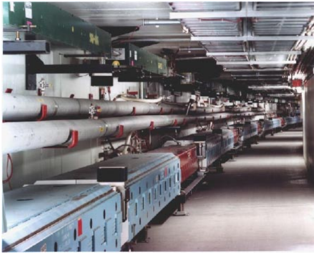
Figure 1: The Main Injector enclosure showing the installed Main Injector (lower) and the permanent-magnet-based Recycler (upper).