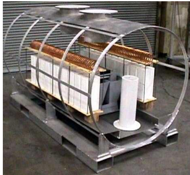
Fig.2 Modulator Tank Physical Mock-up

The cross-section view of the modulator tank is shown in Fig 3. All components that are part of the pulse power delivery system are housed in a single tank, which also mounts the two X band klystrons. The two klystrons and modulator tank assembly forms a single maintenance unit that will be removed to a repair facility when any of the modulator components, or the klystrons fail. This removes the need to handle oil in the Klystron Alcoves.