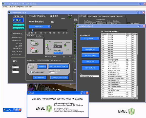
Figure 2: Multilayer monochromator GUI.

A modular architecture has been implemented in the different software layers, so that it allows the reusability of many pieces of the system in future projects. Thanks to the flexibility of the system, it has been possible to add supplementary devices during the commissioning period. The instrument will be available for the user community in November 2008, running with the lighter version of the GUI.