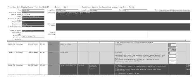
Figure 3: The Control Room e-logbook

Once we were satisfied that jlogBook met all the requirements, we built the structure of the Control Room e-logbook (Fig.3). This logbook was welcomed by the Operators. The emailing feature, thumbnail facilities and filtering capabilities were particularly appreciated.