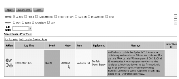
Figure 5: A powerful and customised filtering system

• j5 system filtering has been substantially improved and integrated into the main page. Additionally, custom filter buttons can be configured to meet the needs of frequently used filters (Fig.5)