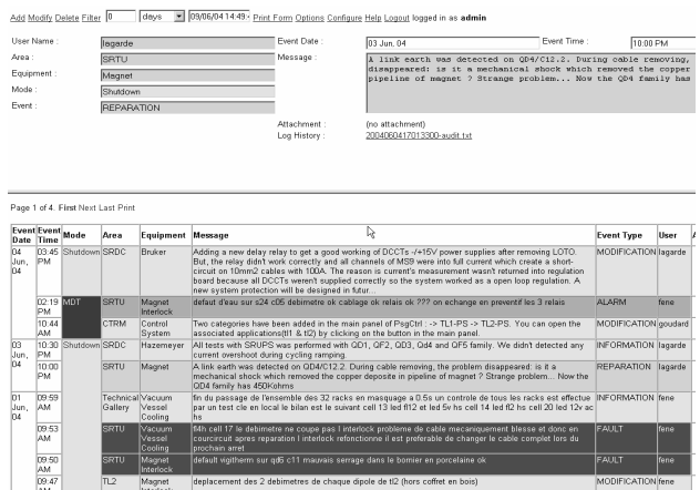
Figure 2: The Power Supply e-logbook

Since then, several other groups and beamlines have now adopted the jLogBook for internal technical archiving and exchange purposes.