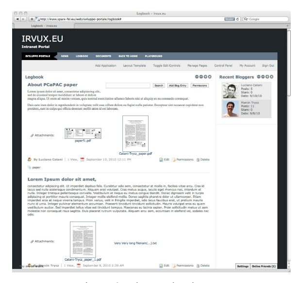
Figure 3: The Logbook page

The dedicated Documents Library is a more efficient replacement of a file server.