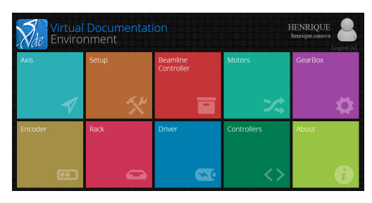
Figure 1: VDE home screen.

the other, the master spreadsheet for the beamline. In the first, there were records of models and manufacturers, for motors, drivers and gearboxes, for instance, whereas the latter concentrated the information of each axis of the installation in a line on the spreadsheet. It also had the necessary information to perform all the needed calculations and determine the primary parameters of the axes as speed and resolution, for example. After all the axes were correctly registered in the master spreadsheet, the DPM was able to generate the necessary configuration files for the EPICS IOCs using VBA macros in the spreadsheet. Finally, all the configuration files were stored in text format and a LabVIEW application was used to transfer the file to the IOC server by FTP.