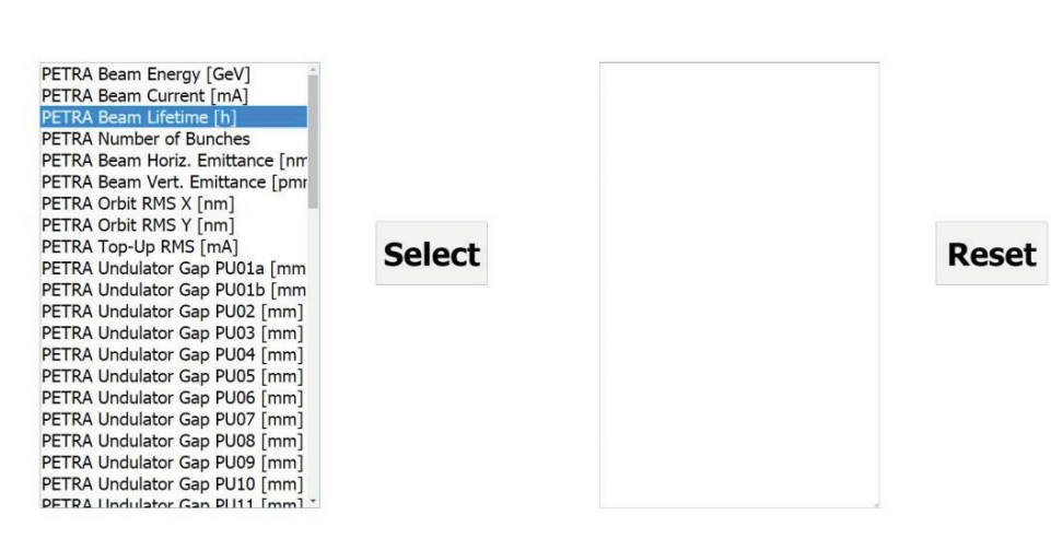
Figure 6: Web2cArchiveViewer embedded in Web2cToGo application (Operation View).

Similarly, sets of interactive widgets have been defined for Web2cArchiveViewer application pages.