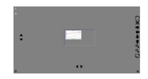
Figure 8: Web2cToGo (Navigation View).