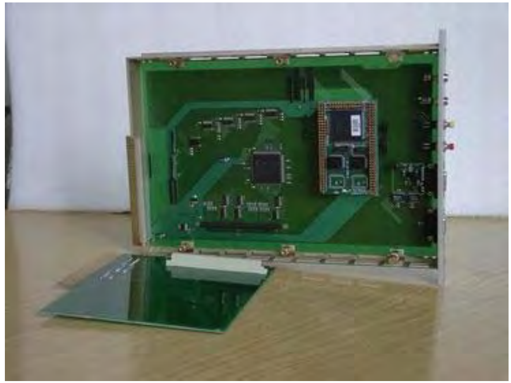
Figure 2: CAMAC crate-controller, developed and made in KCSR.