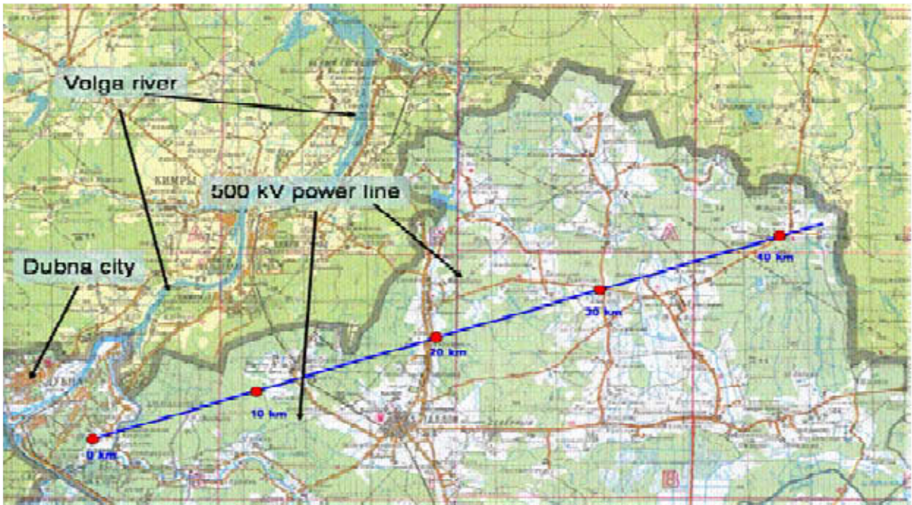
Figure 2: Planned location for ILC near Dubna, Moscow region.