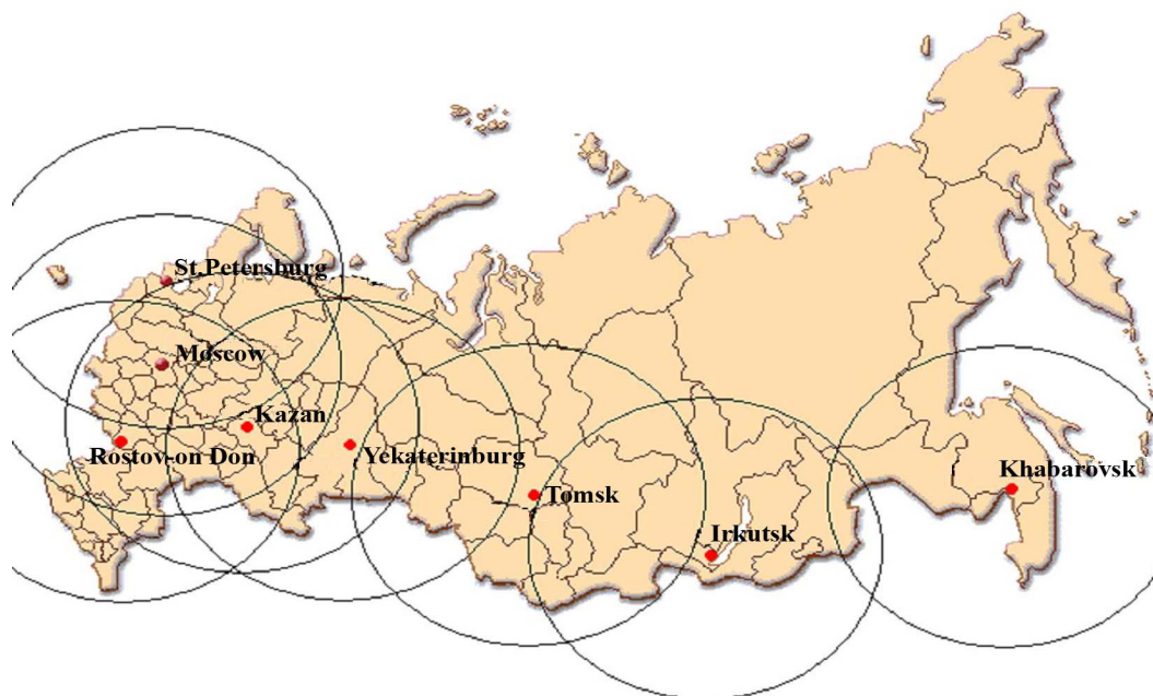
Figure 2: Location of the systems for radionuclide diagnostics on the territory of Russia. Areas covered with the delivery of short-lived radiopharmaceuticals.

A decentralized system for production of short-lived radiopharmaceuticals and location of SPECT proportionally to the density of population are most efficient for our country with its vast territories and extremely non-uniform density of population. At the first stage, it is proposed to construct one system per each Federal District of Russia. Figure 2 shows a supposed location of the systems and areas covered with the delivery of short-lived radiopharmaceuticals for SPECT. So, the systems suggested and SPECT – satellites can solve the problem of fitting regional medical institutions with modern diagnostic equipment of home manufacture. The world experience has shown that the economical and social effect from application of advanced medical techniques several times pays off the investments so far as the health of millions of people is concerned.