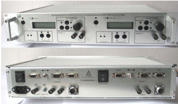
Picture.1. Power supply “Marathon IPP-1/100” – 2 channels, front and rear view.

The first mode is used in stand alone mode and in lab. The second and the third modes are used for computerized control. The second is used to control a few power supplies simultaneously, while the third mode is used to make distributed multi-channel systems with up to 200 power supplies in one network node. Advanced front panel with LCD indicator and digital encoder gives access to all features of the power supply in manual mode.