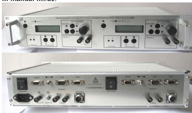
Fig.1. Power supply “Marathon IPP-1/100” – 2 channels, front and rear view.

Advanced front panel with LCD indicator and digital encoder gives access to all features of the power supply in manual mode.