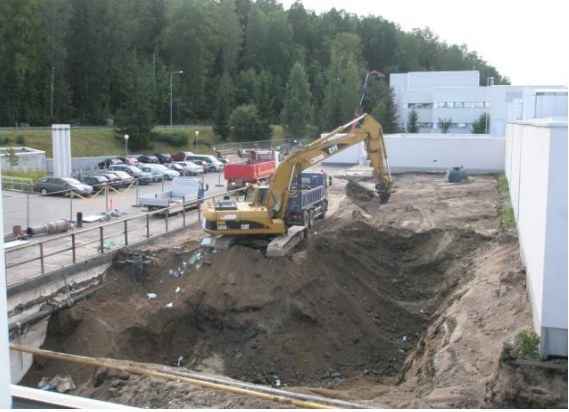
Figures 3, 4: Works on creation of a research center on the site of the University in Jyvaskula, Finland.