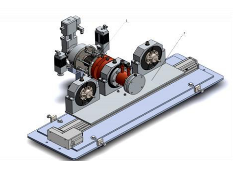
Figure 2: System for remote replacement of liquid and gaseous targets (three in total).

Systems of power supply, water cooling and automatic control will undergo no fundamental updating. Their final configuration is defined at the stage of approval of the beam transport system and target systems' composition by the End User. The cyclotron system to be updated meets to the utmost the needs of university centers planning a wide spectrum of researches in the fields of nuclear medicine, neutron and radiation physics, beam neutron therapy, diagnostic and therapeutic practice applying nuclear medicine methods as well as training of specialists in all the aforementioned fields.