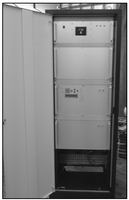
Figure 2: Power converter rack.