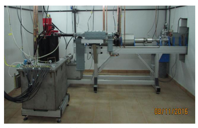
Figure 3: Photo of installed linac at ACCENTR Ltd. Company site, the beam scanner is clearly seen in the right side of the photo.

linac, such accelerator has horizontally conveyor as it can be seen from Figure 3. Such linac is under commissioning at present. It will used for sterilization of medical disposable products.