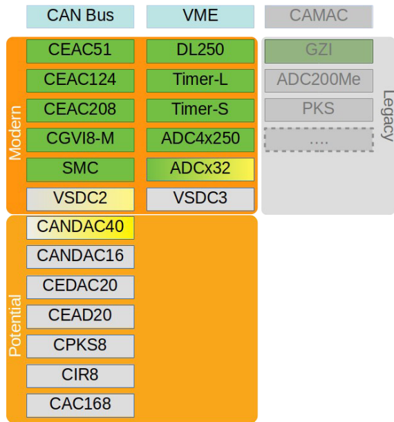
Figure 3: Supported devices.

Content from this work may be used under the terms of the CC BY 3.0 licence (© 2018). Any distribution of this work must maintain attribution to the author(s), title of the work, publisher, and DOI.