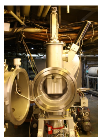
Figure 2: Photo of the multichannel profile detector on the beam-line.

The detector is consist of 64 plastic scintillator with area 1 cm<sup>2</sup>, 4 16 channel PMT H12445 (Hamamatsu) and wavelength shifting fibers Y-11 (200) (Kuraray). The thickness of scintillators is 1 mm. The distance between the centers of scintillator is 25 mm.