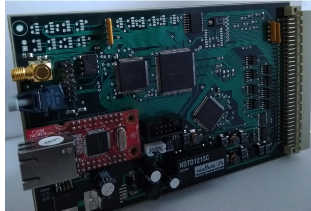
Figure 1: Controller.

As already mentioned, the controller carries out a full set of control, measurement and lock communication functions. The controller controls the charging source by specifying the required voltage on the capacitance, and the output thyristors bridge is controlled via the fiber. As the main protective function, a powerful mechanized discharge key is controlled. At the end of the operation of the source, in the event of an abnormal situation associated with the danger of unauthorized discharging of the storage tank, or if a source of suspected malfunctioning of the power components of the source is suspected, the drive is first discharged with a powerful discharge resistor and then tightly closed with an electric key. If the drive is malfunctioning, the capacitance is shortened by means of a backup high-power discharge resistance.