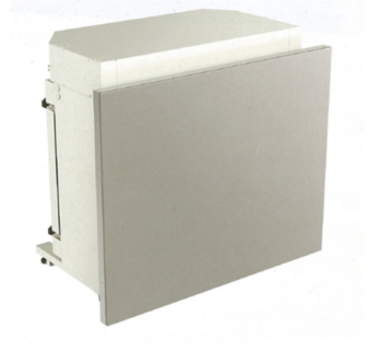
Figure 1:Fan filter unit KOACH F 1050-F, W1050 ×D627×H929mm, Source of drawing: Product catalogue of KOKEN LTD..

Floor COACH Ez is an advanced clean room developed and manufactured by KOKEN Ltd. This clean room consists of fan filter units, guide screen and collision wall. Fan filter units are constructed by stacking multiple fan filter units, KOACH F 1050-F (See Figure 1). Filtered air has uniform velocity and direction. The air flows horizontally downstream along the guided screen. The space between the downstream end of the guide screen and the collision wall is open. The air flow hitting on the collision wall is discharged from this open part. The air flow can capture particulates in the air and discharged particulates from the clean room. And under ideal condition, ISO1 cleanliness is obtained in the area surrounded by fan filter unit, guide screen and collision wall. (See Figure 2 for outline of the Floor KOACH Ez). This clean room is not sealed at all and it is quite different from a normal clean room. But this characteristic gives us many advantages in SRF cavity assembly.