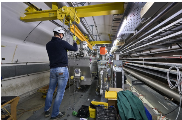
Figure 4: Installation of the prototype cryomodule on the transfer table. The two skids supporting one RF charge and circulator for each cavity are visible on the table, to the right.

Transport of the cryomodule from the test hall SM18 to its final location on the transfer table was monitored with tri-axial accelerometers and inclinometers to ensure that the transportation specification was respected. The cryomodule was finally lifted from the transport trailer and lowered on the table; supporting jacks were slid under the module and attached to the table, before lowering the cryomodule. Figure 4 fixes the moment when the cryomodule was lowered on the transfer table.