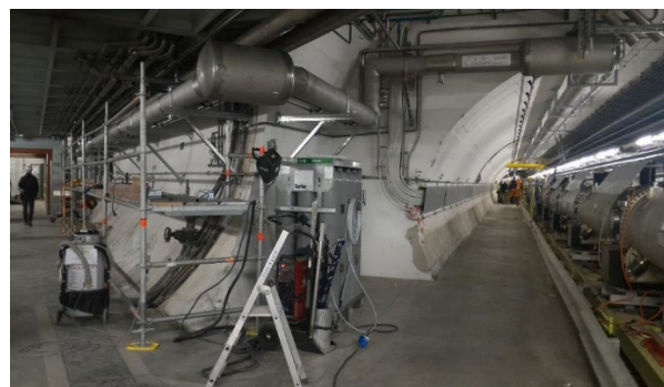
Figure 3: The cryogenic distribution line during installation in winter 2016-2017.

Site preparation and installation were fractioned by the beam operation calendar of the SPS. During the 14 weeks extended year-end technical stop in winter 2016-2017, the beam vacuum layout was modified to introduce the new vacuum sector, with modification of all nearby vacuum chambers and installation of new carbon coated pipes. The two large helium pumping units were installed while the beam line was partially dismantled and a large portion of the tunnel floor was consolidated with a suitable resin to accommodate the transfer table basis. With a long scaffold covering all section of the SPS machine from the location of the test-stand to the tunnel extremity of the TA6 gallery, the cryogenic transfer line was installed in 6 m long segments, welded in situ then hoisted up to the tunnel vault. Figure 3 shows the cryogenic distribution line at the crossing between the tunnel (right) and the TA6 access gallery (left), during installation.