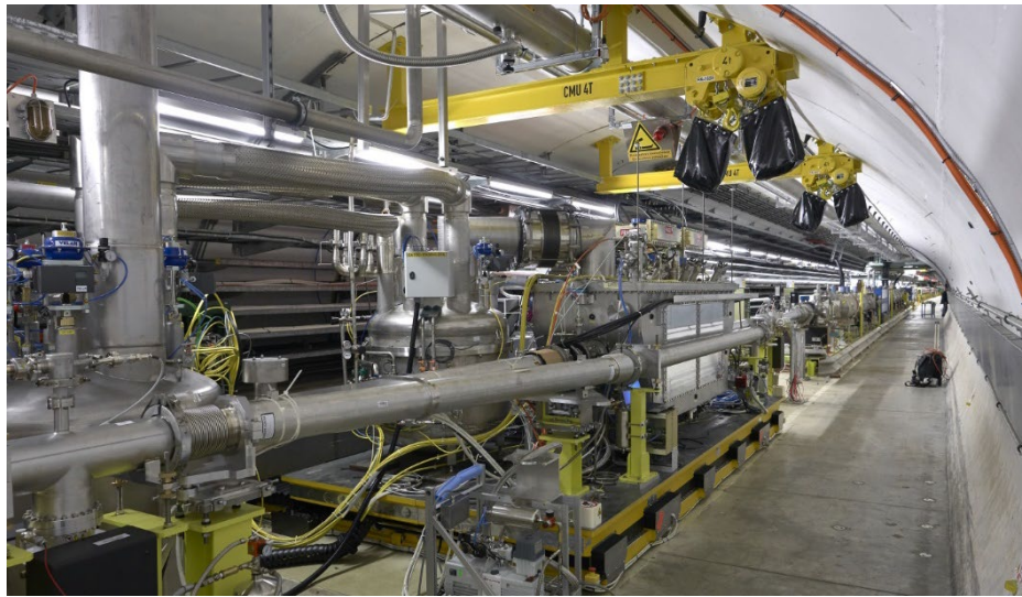
Figure 2: The completed SRF SPS test stand, seen from the direction of the beam. The transfer table is in experimental position; the articulated Y-shaped chamber and cryogenic Service Box with jumper to the DQW cryomodule prototype are clearly visible, while the RF passive equipment is hidden behind the cryomodule.

In the surface building BA6, on which the access pit to LSS6 opens, a large area was used for storage only, with space under the false floor encumbered by obsolete cables. In the short 2015-2016 end-of-the-year technical stop of the SPS, it was easy to free all those areas and remove old cables and pipework from tunnel and surface building, then laser scan the entire area for a complete 3D numerical reconstruction.